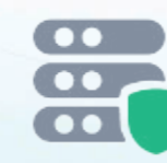
Security audits (Penetration test)