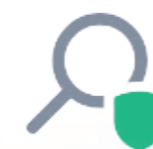
DATEV Hosting (ISO 27001)